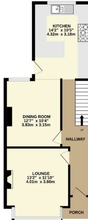
GROUND FLOOR 545 sq.ft. (50.6 sq.m.) approx.